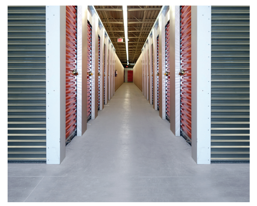
"We will be using ResinDek panels instead of concrete on all future construction", said Hal Spradling.