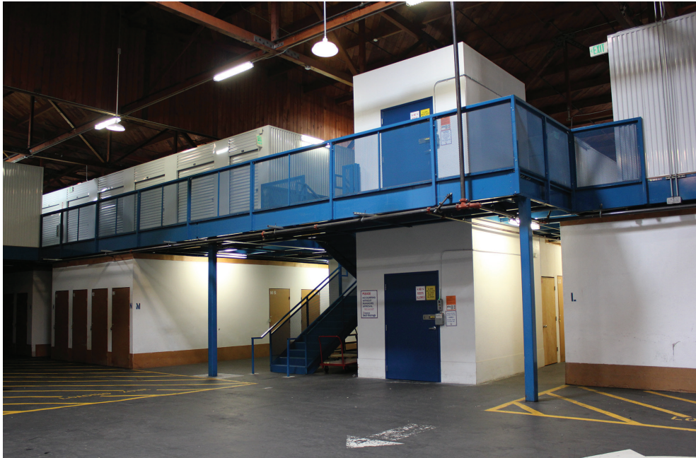
Central Self-Storage (formerly Pacific Mini Storage)