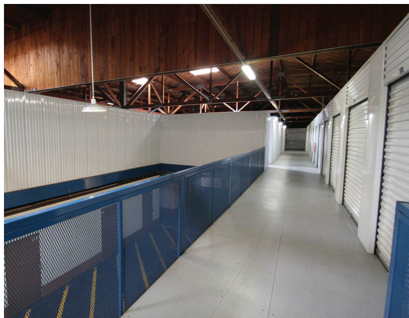
ResinDek panels are less expensive than concrete and can be easily installed without evacuating the occupied units below. ResinDek floor panels shown are 13 years old!

*Actual savings may vary based on project scope and location.