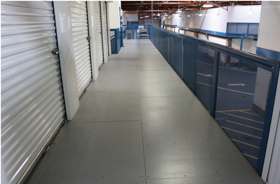
After thirteen years in service, ResinDek® panels on the 2nd floor still look amazing!

In 2003, Pacific Mini Storage wanted to expand their enclosed facility located just outside San Francisco, California. However, with the high cost of land, traditional horizontal expansion wasn't feasible. So Pacific Mini Storage hired Cubic Designs to "go vertical" with the design and install a mezzanine directly above the existing storage units. This doubled the facility's size and revenue, as an additional 54,000 square feet of storage space was added. ResinDek® panels, structural steel, and corrugated metal decking provided the ceiling for the first level and flooring for the second level.