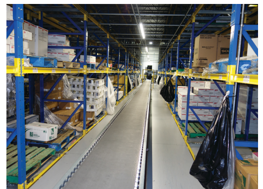
After 7 months of heavy use, ResinDek® panels still look great!

"We have been pleasantly surprised at the durability of the ResinDek panels", said Warehouse Director at the Imperial Facility. "In the past we have used concrete, bar grate, and polydeck. Our space is subjected to temperatures ranging from 55°F. to -20°F., and we do not "baby" our floors. Each flooring type has its advantages and disadvantages, but ResinDek panels are a solid choice for us. They are less expensive than concrete, and easier to walk and transport our products on than bar grate. We are moving 6,000 cases per day from this facility, so our floors see a lot of traffic."