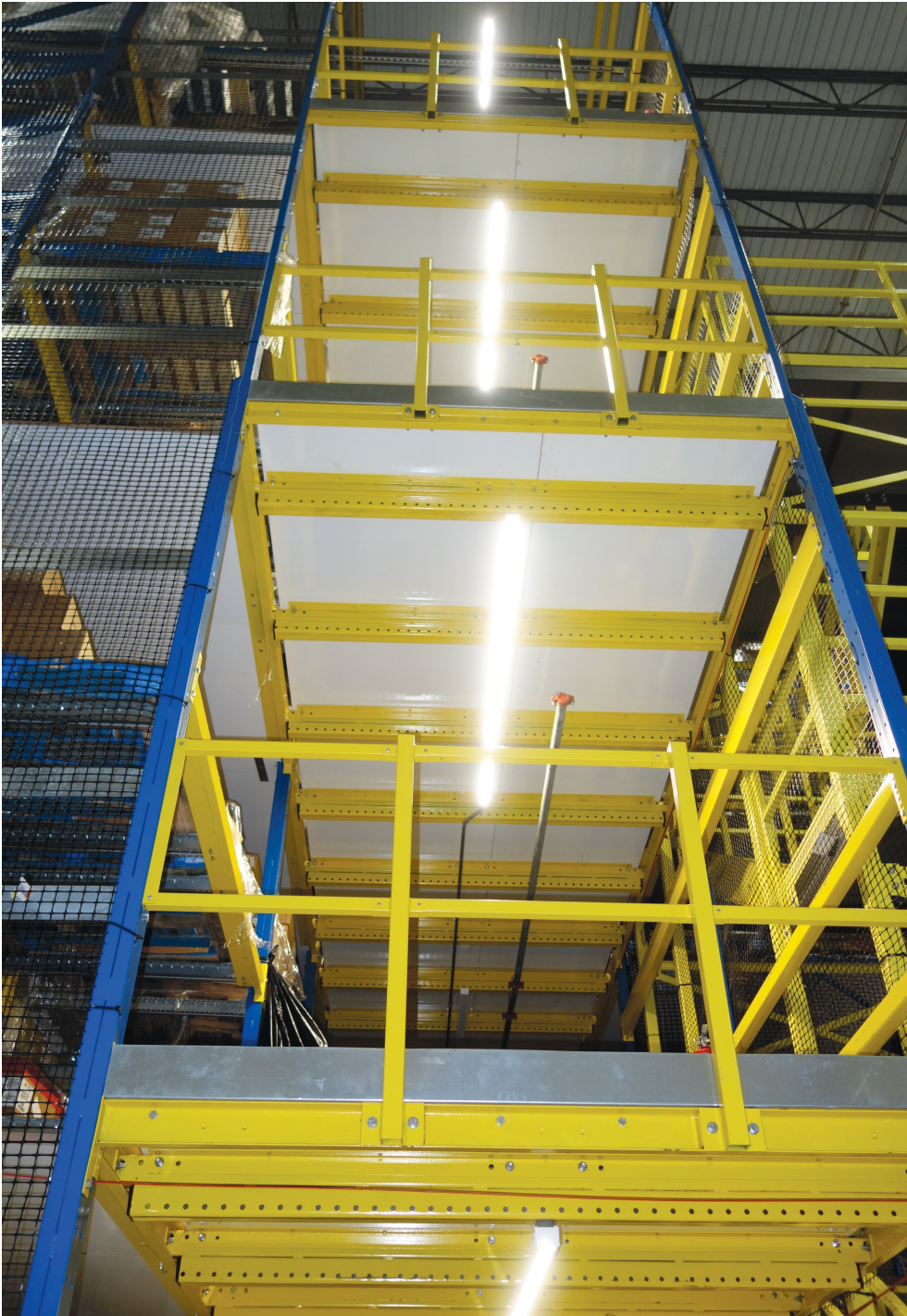
Imperial, PA DC features ground + 3 additional cold storage pick module levels

In 2003, a Food Service Company with 24 distribution centers across North America was looking for an alternative flooring solution on their elevated work platforms for their cold storage facilities. They had used concrete, bar grate and polydeck in the past, but for various reasons they were not satisfied. They decided to try ResinDek® flooring panels. They were so impressed with the strength and durability of ResinDek panels that they installed over 375,000 sqft of ResinDek Xspan in three of their distributions centers (Kenosha, WI, Douglasville, GA, and Imperial PA).