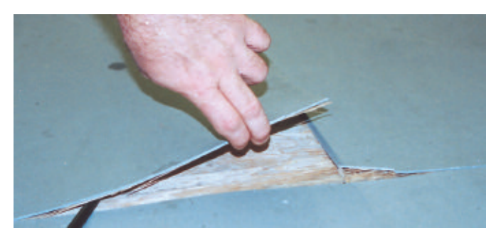
Floor problem with poly-deck

By August 2005, the balance of the original poly-deck flooring was causing additional problems for Polo. Cornerstone Specialty Wood Products was brought back in to replace the rest of the original 120,000 square feet of poly-deck with ResinDek.