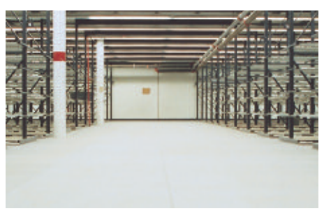
After ResinDek® replaces poly-deck the distribution center is a showplace!

"Employees were expressing concerns that areas of the poly-deck panels had started lifting up and were concerned about tripping. We struggled with these concerns and had been fighting with this problem for years. In the main aisles we had covered the poly-deck with steel plates to be able to move products and to prevent safety hazards. This patchwork increased as the polydeck panels continued to cut and split in several of our heavy traffic areas. As the panel comes apart, it flexes up and down with traffic resulting in splits that look like a series of alligator skin cracks. The cracks were about 12" long and 1-2" apart."