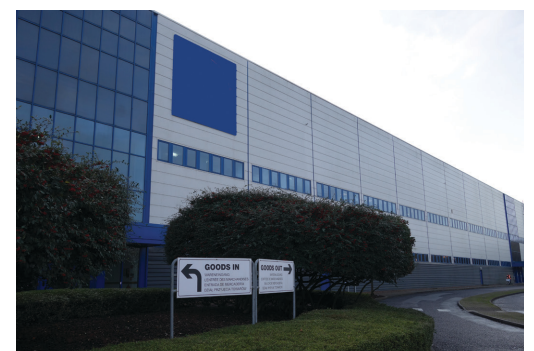
Distribution Center, Lutterworth, UK

ResinDek® MAX was chosen because of its economical solution and its exclusive warranty. "Our biggest initial concern was timing," said the Procurement Manager. "We had our pre-construction meeting in late August, and needed to have the structure operational by early December. There were 7 different trades that had to work around our existing operations in a tight space. Mezzanine International and Cornerstone Specialty Wood Products® came to the initial meeting, and found a way to get the project delivered on time."