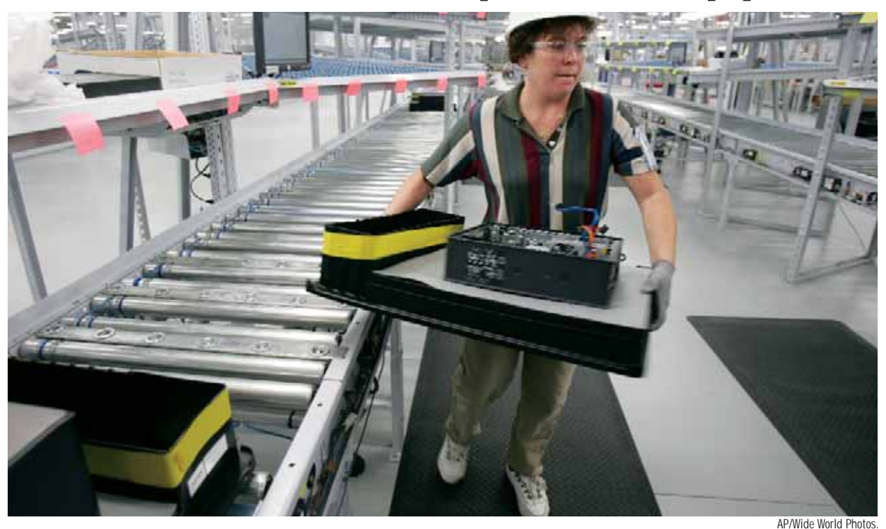
Dell manufacturing facility with ResinDek products installed

ResinDek® ESD is designed to exceed industry requirements for static controlled flooring, shelving and work surfaces.