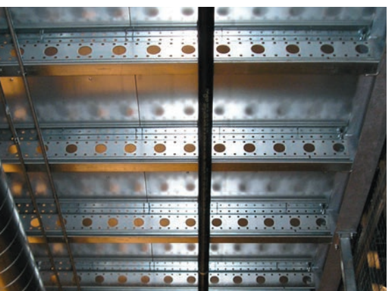
Flame resistant underside is available in white or silver

ResinDek Xspan FR is avaialble in a variety of lengths, widths and tongue and groove configurations to fit custom aisles and storage rack applications. All ResinDek flooring panels come standard with a 10 year product warranty that covers pallet jack loads for 10 years! Cornerstone Specialty Wood Products, LLC® warrants all ResinDek panels to be structurally sound, able to safely carry the specified design loads, and free from defect. For complete details on the ResinDek 10-year product warranty please visit www.resindek.com.